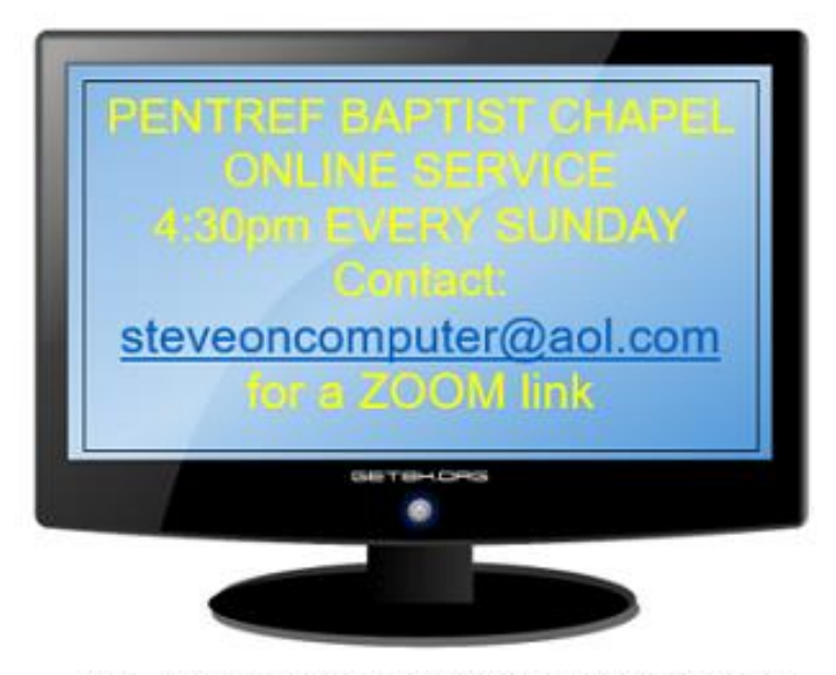
ALL ARE WELCOME TO COME AND JOIN US

This service may be particularly helpful if you are stuck at home for any reason or if your chapel only meets occasionally.