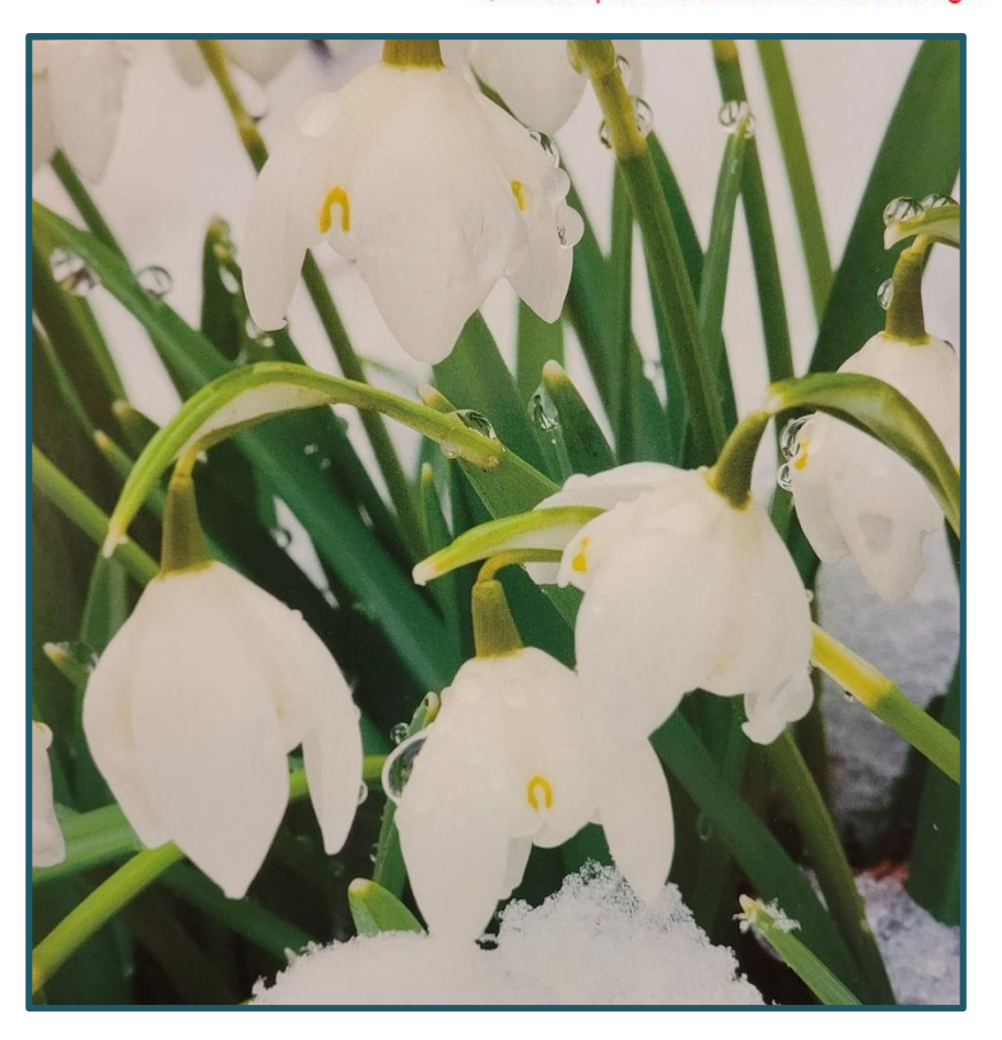
The Newbridge-On-Wye Newsletter Pentref Baptist Church February 2024