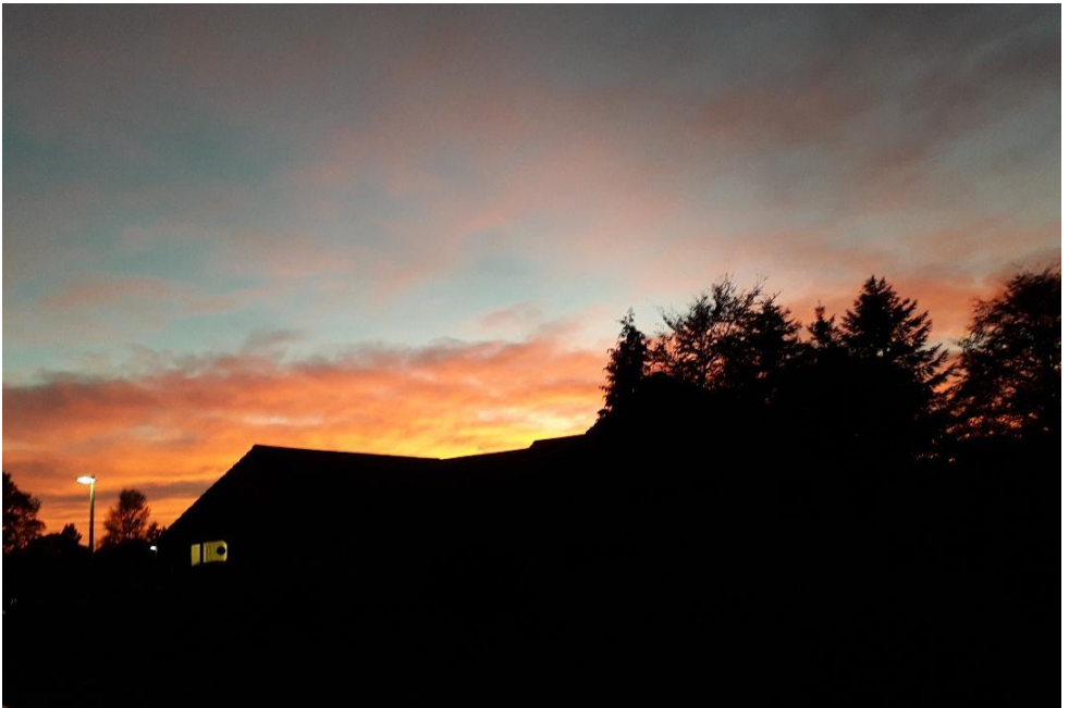
(Sunset over Knapplands)

The Newsletter Of Newbridge-On-Wye Baptist Church February 2019