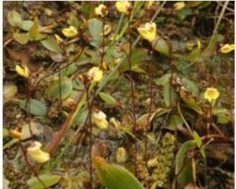
Lesser bladderwort (carnivorous)