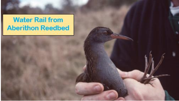
Water Rail from Aberithon Reedbed

Dr Fred Slater updates us on the Aberithon project: All was going to plan until the winter rains put a stop to path making, but fencing, laying the last of the big heap of stones and getting some “rustic” seats and a picnic bench in place are now again